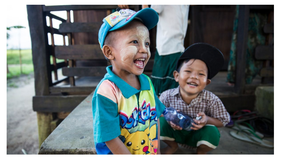
Research shows MCCT programme reduced stunting from 30 to 26% in 3 years

LIFT and stakeholders from MCCT met to discuss recent research. According to results, the MCCT has over 3 years led to a 4% reduction in stunting in the Central Dry Zone.