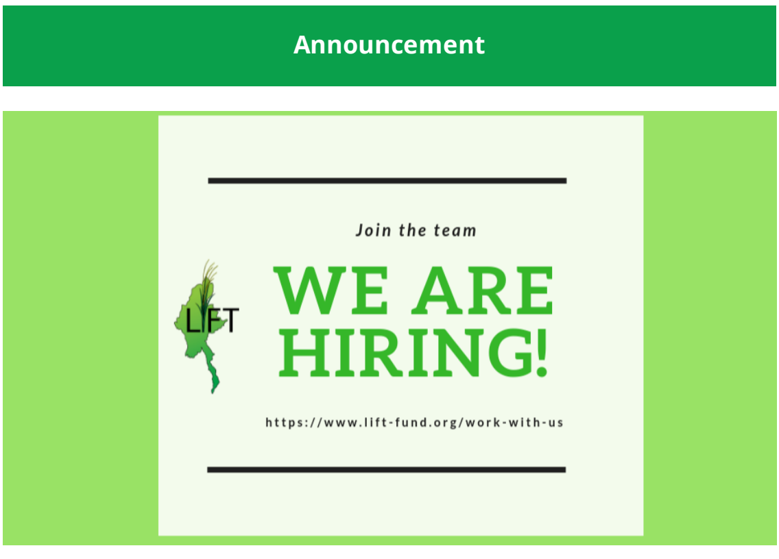
Do you want to work with us? Check out the latest positions at LIFT here.