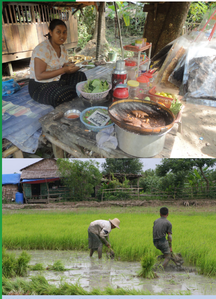
Helping Myanmar achieve the Millennium Development Goal of eradicating extreme poverty and hunger.

Discussions began in 2008 among a group of donors on ways to support poor and disadvantaged people in Myanmar to address the above-mentioned problems. In late 2008 and early 2009, the European Commission supported the work of two consultants to provide advice on the architecture and key thematic areas of a fund that like-minded donors could support. The consultants carried out extensive consultations with donors and key stakeholders concerned with livelihoods and food security in Myanmar.